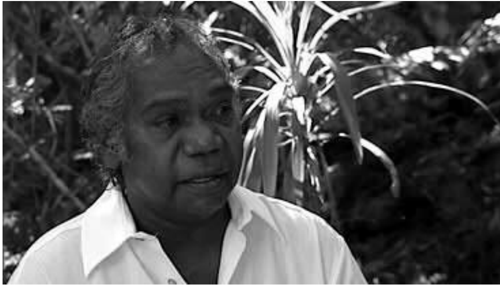
Mandawuy Yunupingu from Yothu Yindi.

Study Guide for Episode 11 — Living in the Mainstream